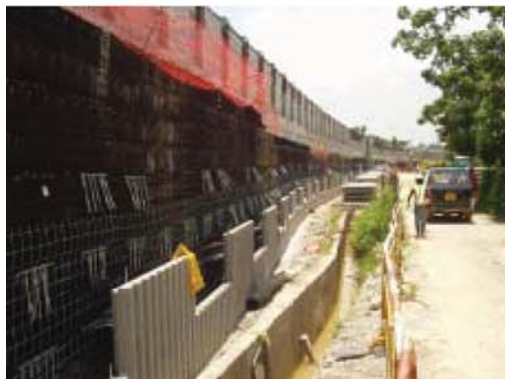
Two stage construction