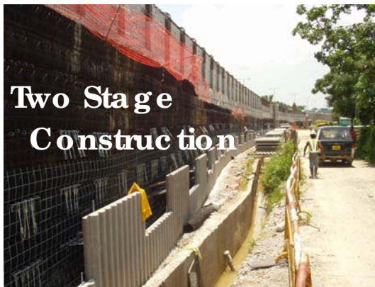
Two Stage Construction