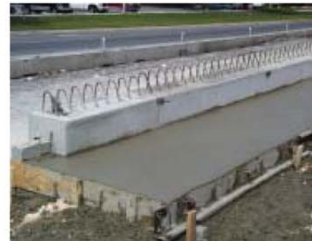
CIP barrier with precast coping