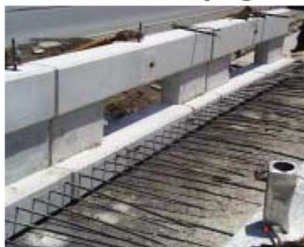
Single unit precast barrier and coping