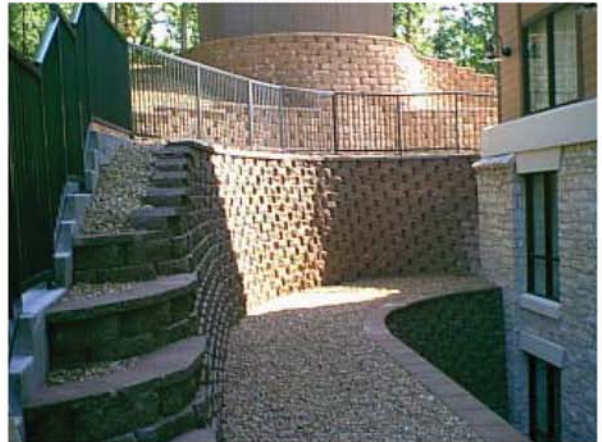
Block facing with geosynthetic soil reinforcement