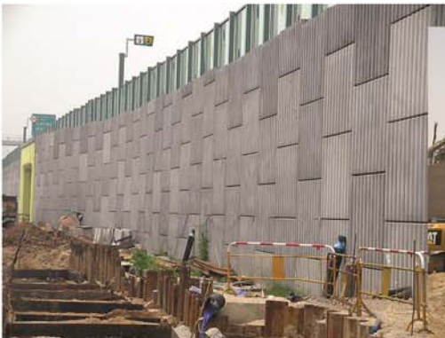
Hong Kong, China