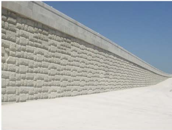
Precast panel facing with galvanized steel or geosynthetic soil reinforcement